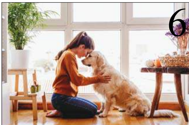
Marisa Abela