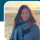
Angel PIN: 1441